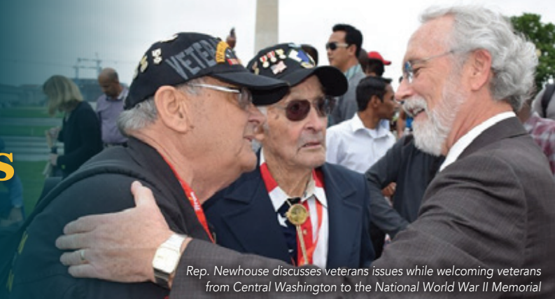
Rep. Newhouse discusses veterans issues while welcoming veterans from Central Washington to the National World War II Memorial

Listening to Washington Veterans to Better Serve You in Congress