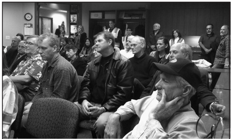
A large group of Chamber members were on hand December 3rd for the annual Legislative Send Off.