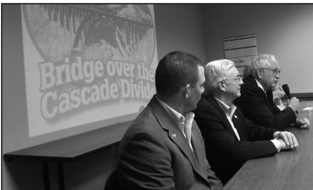
Legislators from Districts 13-14-15 were on hand for the “Bridge over the Cascade Divide” themed event.