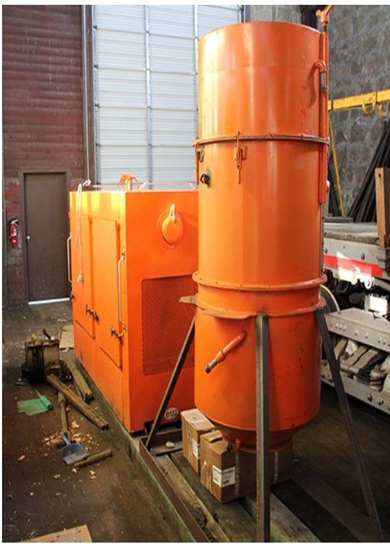
An industrial vacuum was purchased by Bill Allen for use in cleaning the in-street track on 6 th Avenue.