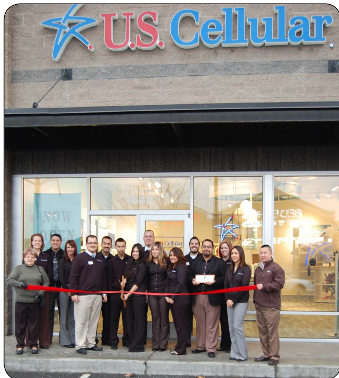
Ribbon Cutting for the US Cellular newly expanded store in the Valley Mall Plaza – Dec. 16th

In July, 2011 construction on the 16 YWCA Transitional Housing units was complete, with families moving in just before Christmas. The new shelter provides a safe and healing environment, YWCA understand the importance to families of having a safe place to stay, a support system of staff and other survivors who have experienced what they are going through, and having access to the resources as they rebuild their lives.