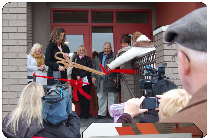
YWCA Open House and Ribbon Cutting Dec. 14th