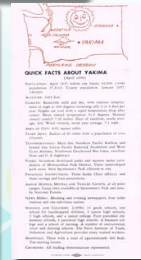
Chamber Brochure 1958