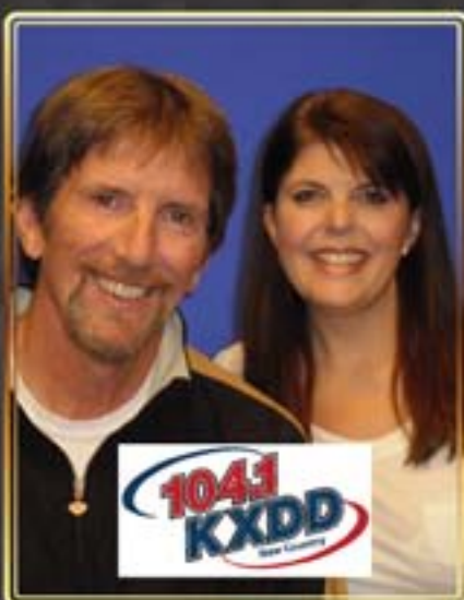
Hosted by Dewey & Charlie

Friday, September 14, 2012 Yakima Convention Center 6:00pm Reception 7:00pm Dinner & Awards Program $65 per person $500 for table of 8