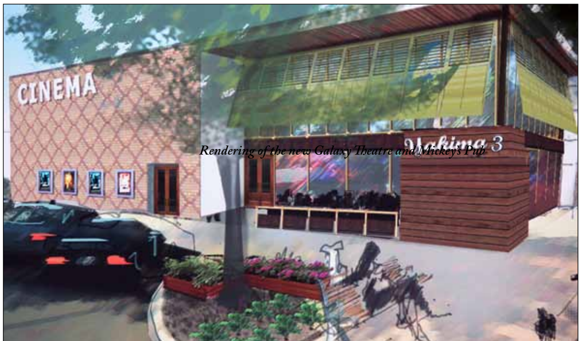
Rendering of the new Galaxy Theatre and Mickey's Pub