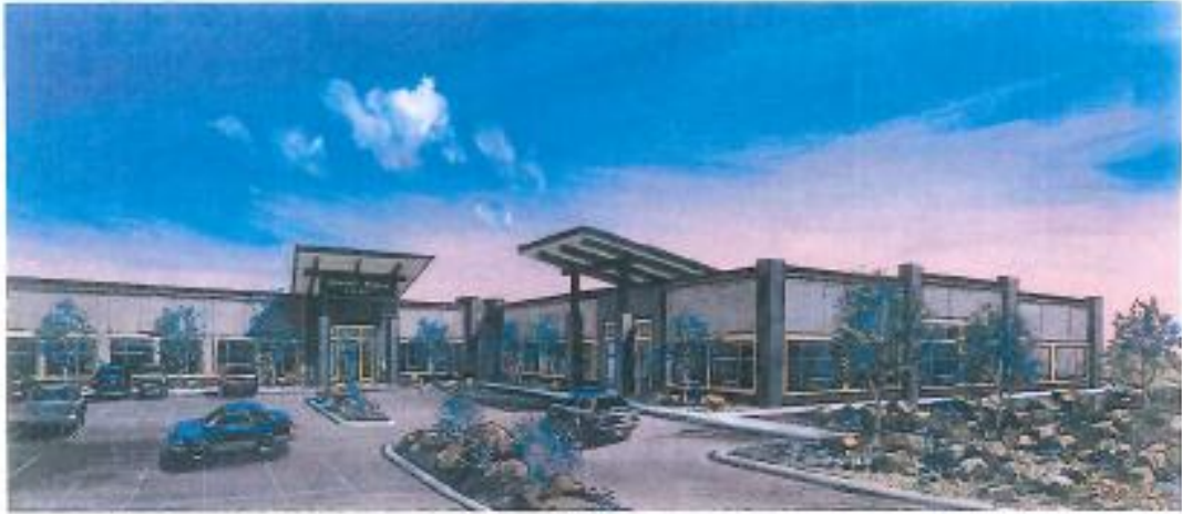
A State of the Art Green Building