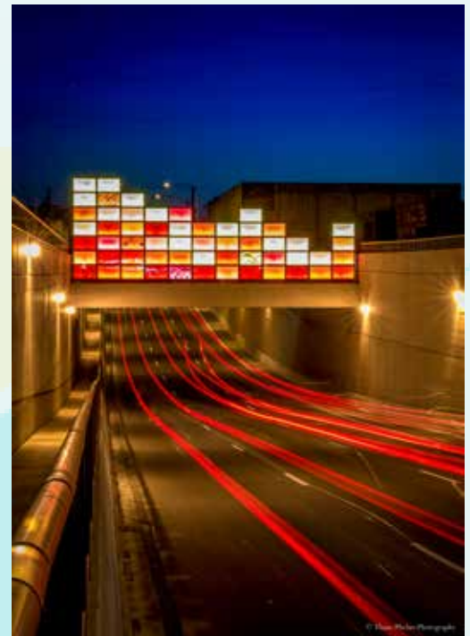
The latest Yakima public art display "Bins of Light" on Lincoln Ave.

Bekins Northwest 1891 N 1st St Yakima, WA 98901