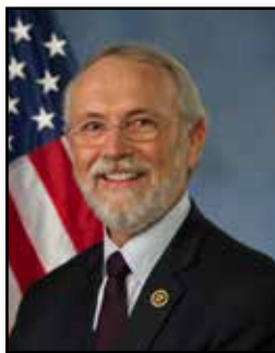
Representative Dan Newhouse (R-WA 4th District)

In December, I voted for, and Congress approved, The Tax Cuts and Jobs Act, crossing the finish line to provide the first major overhaul of our nation's tax system in 31 years. Providing pro-family, pro-growth tax reform is a major promise delivered to the American people.