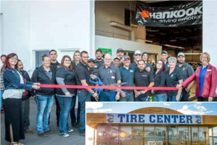
Chamber Ribbon Cutting at Tire Center's all new and larger facility at 1710 South First Street, They want to be your tire and wheel center.