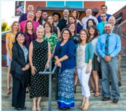
Leadership Yakima Class of 2017

The 2017 Veteran, Dependents, and Graduates Job Fair is another program