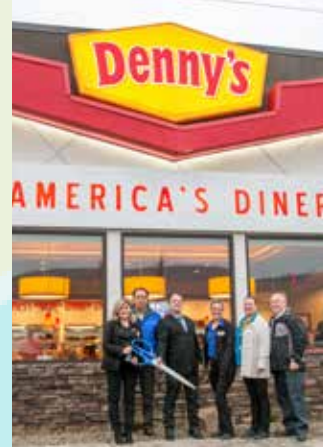
Chamber Ribbon Cutting for the all new Denny's, America's Diner open at 3704 Fruitvale, Yakima.