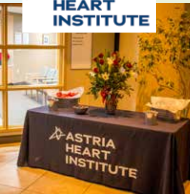
The opening of the new Astria Heart Institute, 1005 West Walnut. The facility features the new cardiology clinic, the new Cath Lab and the future home of the Astria Heart Institutes Diagnostic Center.