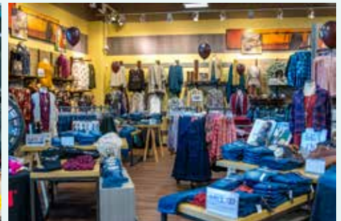
Grand Opening of America's largest western and work boot store which also features western and work apparel. Boot Barn in Yakima at 1837 South First Street.