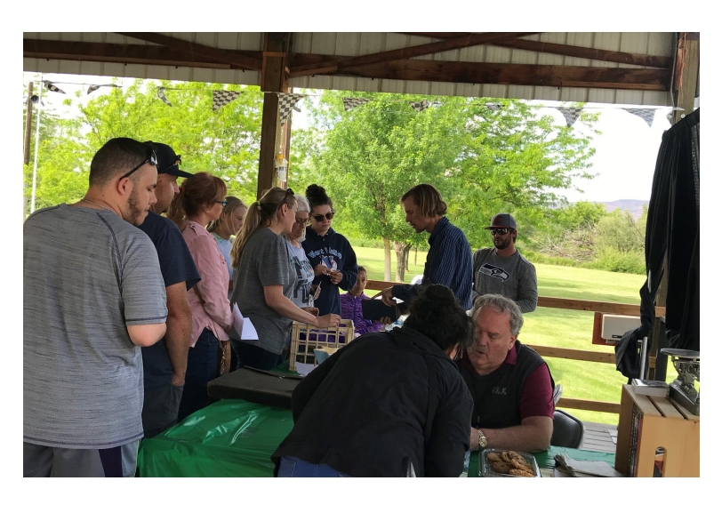
Leadership Yakima Project First Annual Appraisal Roadshow