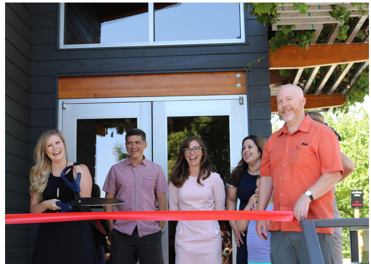
Freehand Cellars Ribbon Cutting