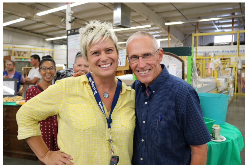
Business After Hours - Habitat for Humanity