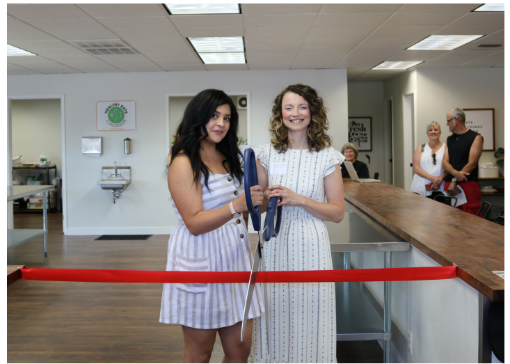
Healthy Eats Ribbon Cutting