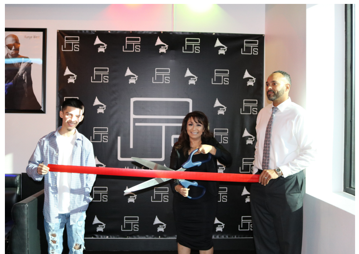
PJs Music Box Ribbon Cutting