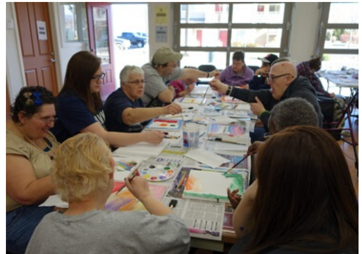
Community Living group activity