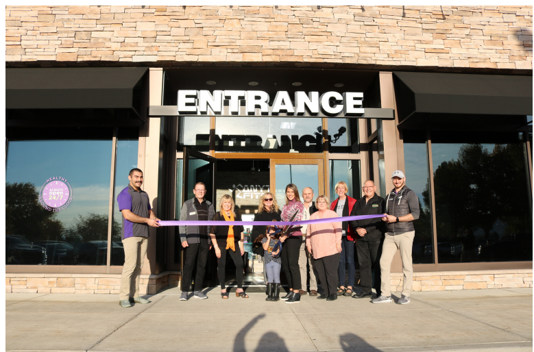
Community Living group activity