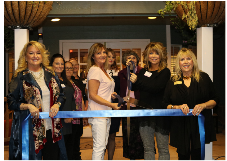
Avamere Ribbon Cutting and Open House