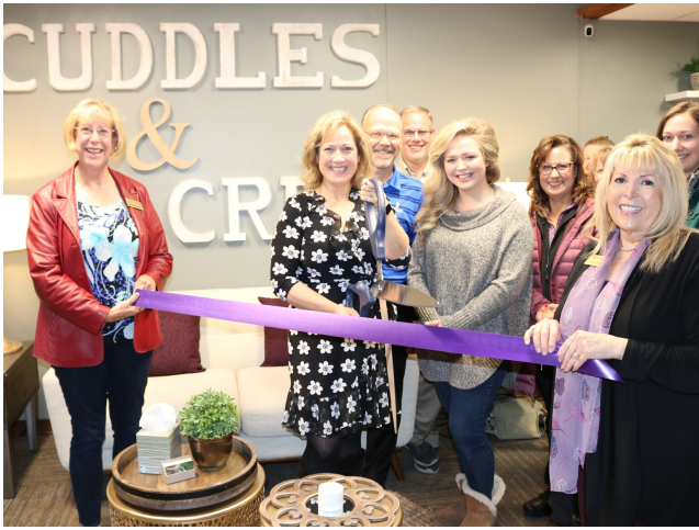
Cuddles & Cream

D2 Communications Delaney's Lost Sock Laundromat Hyatt Management Corp. Kana Winery Ledgestone Hotel Pacific Northwest University of Health Sciences Spectrum Business Stokes Lawrence Velikanje Moore & Shore Ummalina Yakima Valley Spa Retreat Washington Fruit Place & Gift Shop