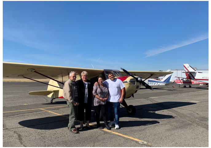
Lunch at Reno's

AAU Sports Auto Art & Collision Repair Baird Bale Breaker Brewing Company Bear Trade Services Cornerstone Home Lending Don's Donuts & Julie's Java First Fruits Invisible Ink