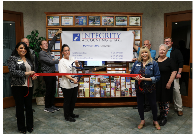
Integrity Accounting & Tax Ribbon Cutting

Community Living's mission is to empower individuals with developmental disabilities to live in the community through the consistent provision of instruction and support services based upon individual wants, needs and desires. Instruction and support services are provided in a manner that recognizes that individuals are people first, with unique abilities and personalities.