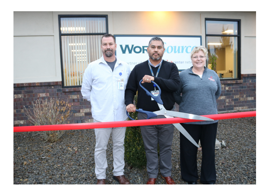
Work Source Employer Business Center Open House & Ribbon Cutting

Favorite annual event in Yakima: Hot Shots! I have volunteered for the last 11 years. Although it is a super long weekend, the fun is all consuming.