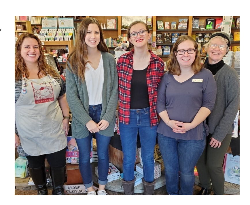
Inklings Staff on Shop Small Saturday Thank you for supporting local business.