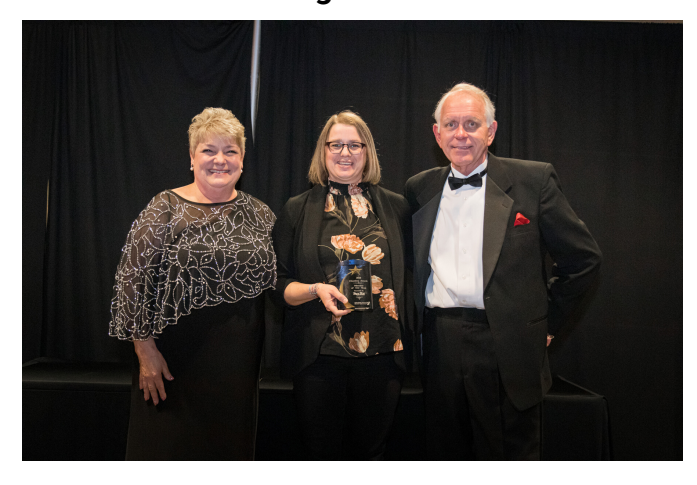
2019 GYCC Member of the Year - Tree Top

Celebrating the people and businesses that make this valley great!