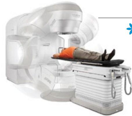
North Star Lodge now has two Varian TrueBeam Linear Accelerators.

To continue providing cancer patients with state-of-the-art treatments, Memorial and the Memorial Foundation contributed $6.4 million towards the purchase of many technological advancements which included two new radiotherapy systems for North Star Lodge. This new generation of imaging equipment, Varian's TrueBeam Linear Accelerators (LINAC), precisely delivers radiation to cancerous cells in a quarter of the time, leaving healthy cells unharmed. Radiotherapy can be used to treat various types of cancers in the head and neck, breast, abdomen, and liver.