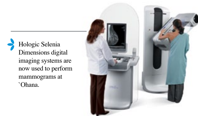
Hologic Selenia Dimensions digital imaging systems are now used to perform mammograms at Ohana.

The $1.2 million upgrade at Ohana includes two digital mammography machines, advanced image display computers, a high resolution digitizer for converting film images and a more comfortable sterotactic table used for breast biopsies. The Memorial Foundation assisted in raising $250,000 for the new technology.